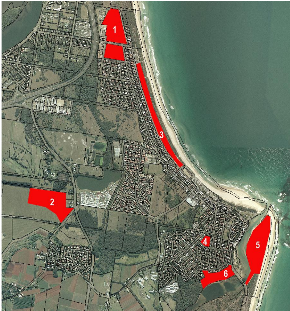
Figure A. Potential Skate park locations in Kingscliff